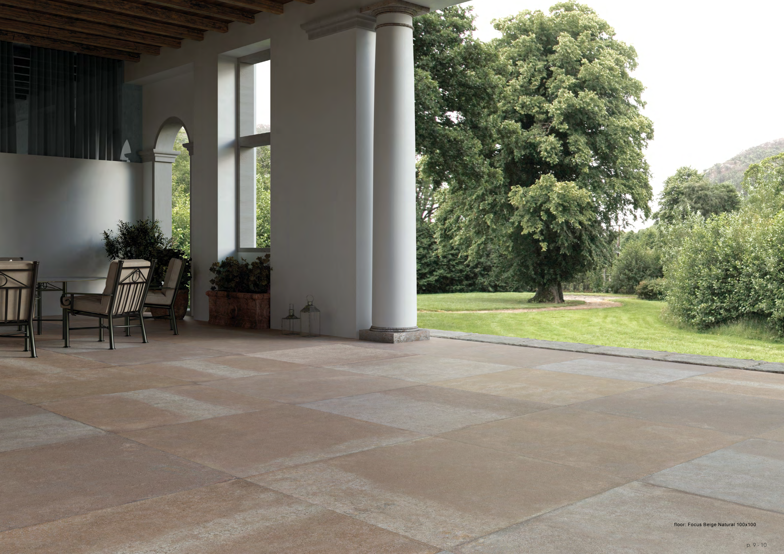
floor: Focus Beige Natural 100x100