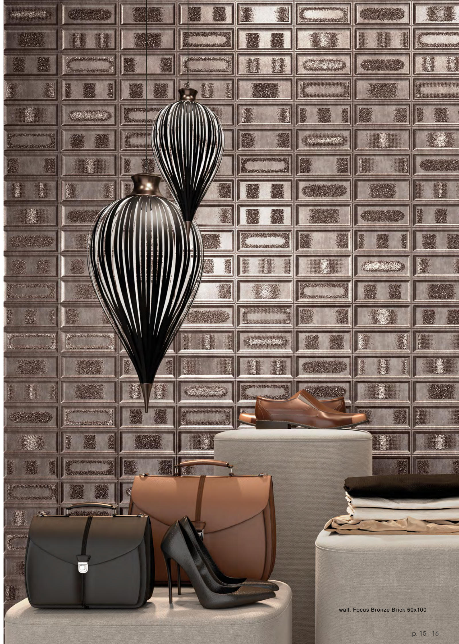
wall: Focus Bronze Brick 50x100

⚠ BRONZE COLOR TO BE CLEANED WITH PH NEUTRAL EL COLOR BRONZE DEBE LIMPIARSE CON PRODUCTOS PH NEUTROS All sizes are rectified and without bevel edge finish. Todos los formatos son rectificadas y no biselados. Tiles with random shade and aspect variation. Producto con alta variación cromática y desentonificación en composiciones.